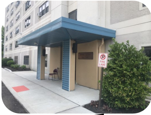
Park Eden Transformation